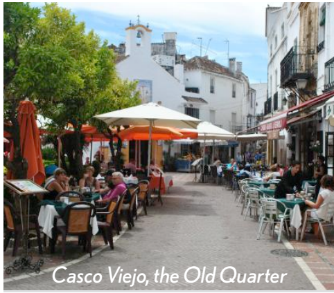
Casco Viejo, the Old Quarter