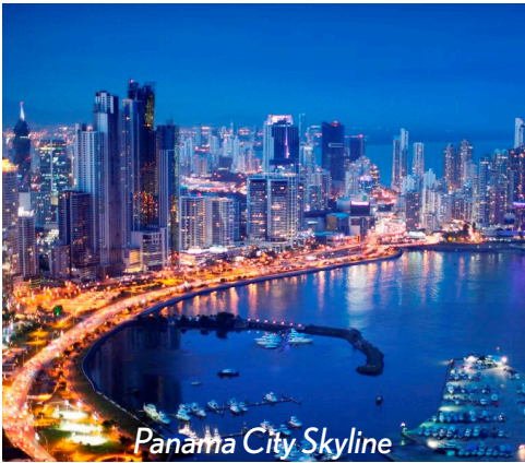
Panama City Skyline