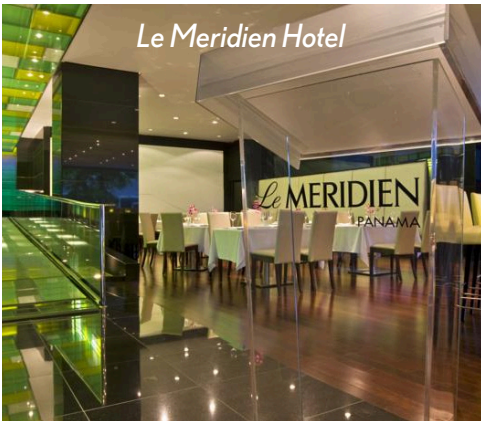
Le Meridien Hotel