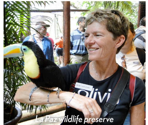
La Paz wildlife preserve