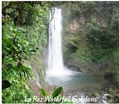
La Paz Waterfall Gardens