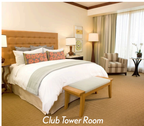
Club Tower Room