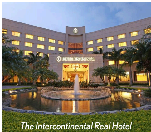
The Intercontinental Real Hotel

*Note: Because of the volcano's altitude and the many steps during the walk to the waterfalls, this tour is not recommended for guests with heart conditions and/or limited mobility.