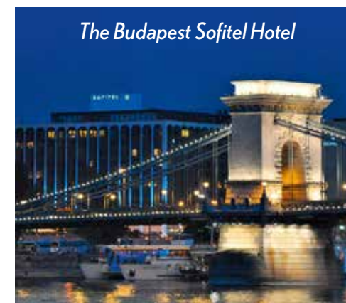
The Budapest Sofitel Hotel