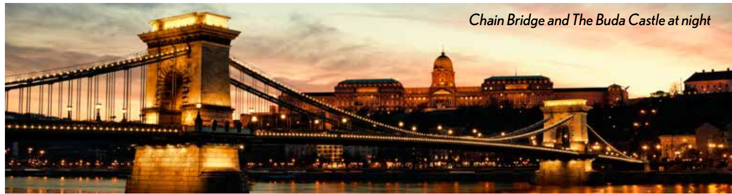
Chain Bridge and The Buda Castle at night

Often called the “Pearl of the Danube,” Budapest is the pulse of Central Europe. It’s an enchanting city of vibrant contrasts between Old World opulence and contemporary lifestyles. Known as the finest city of the Habsburg dynasty, Budapest is made up of two separate towns—hilly Buda on the Danube’s western bank and Pest on the eastern side. This is a place filled with historical sights, including Roman ruins, the Neo-Classical Parliament and many famed Turkish thermal baths. Budapest is richly endowed with natural springs of thermal waters that supply the city’s many baths.