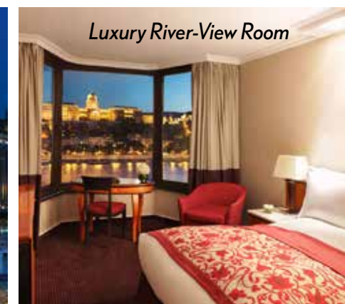
Luxury River-View Room