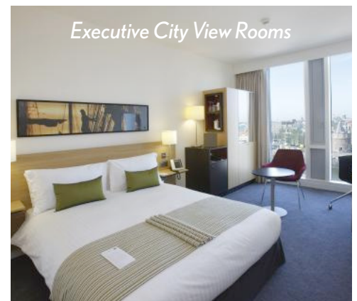
Executive City View Rooms